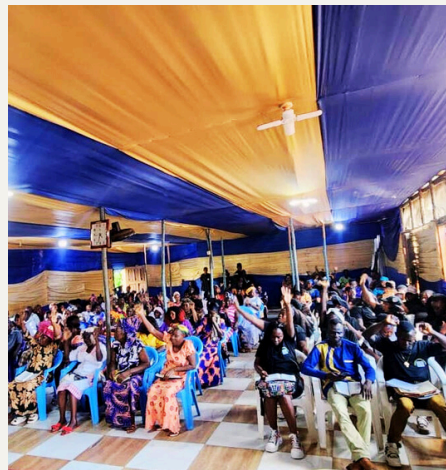
Calvary Chapel Sierra Leone - Waterloo

The mission field has been a much more difficult endeavor as persecutions occur far too often, with officials seeming to turn a blind eye to all the violence inflicted on Christian villages. But God... through Whom boldness and an unwavering courage in continuing to bring the Gospel message persists among the Nigerian missionaries. Their heart is as God's heart towards all of us: The Lord is not slack concerning His promise, as some count slackness, but is longsuffering toward us, not willing that any should perish but that all should come to repentance. 2 Peter 3:9